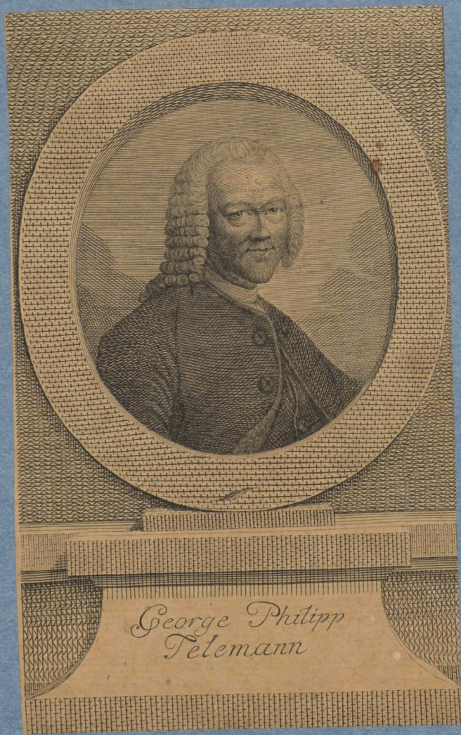
George Philipp Telemann