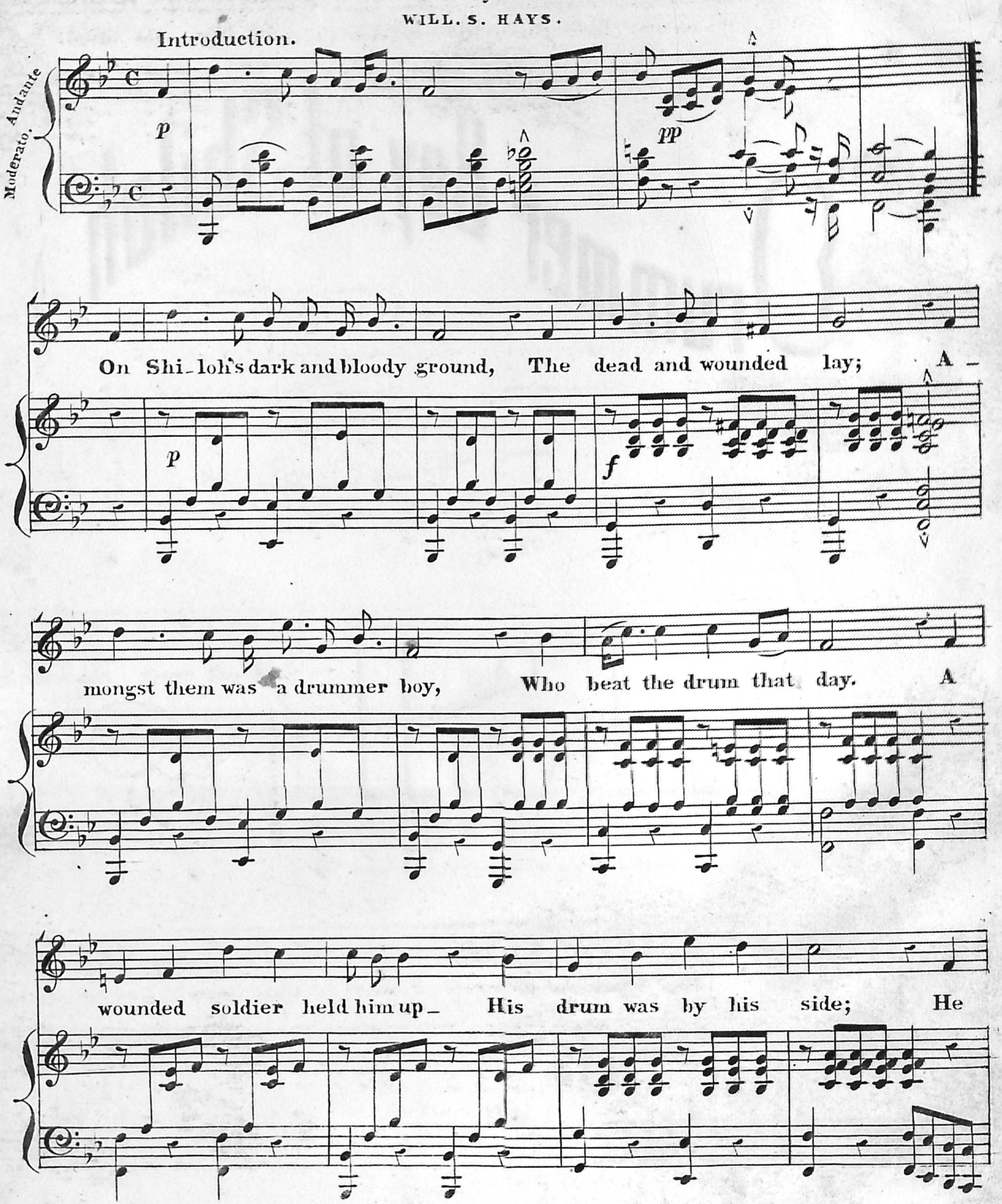
Entered according to Act of Congress, A.D. 1863. by D.P. Faulds. in the Clerks Office of the District Court of, Ky.