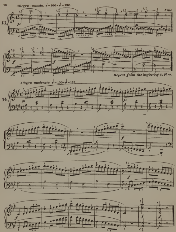
979 - 14