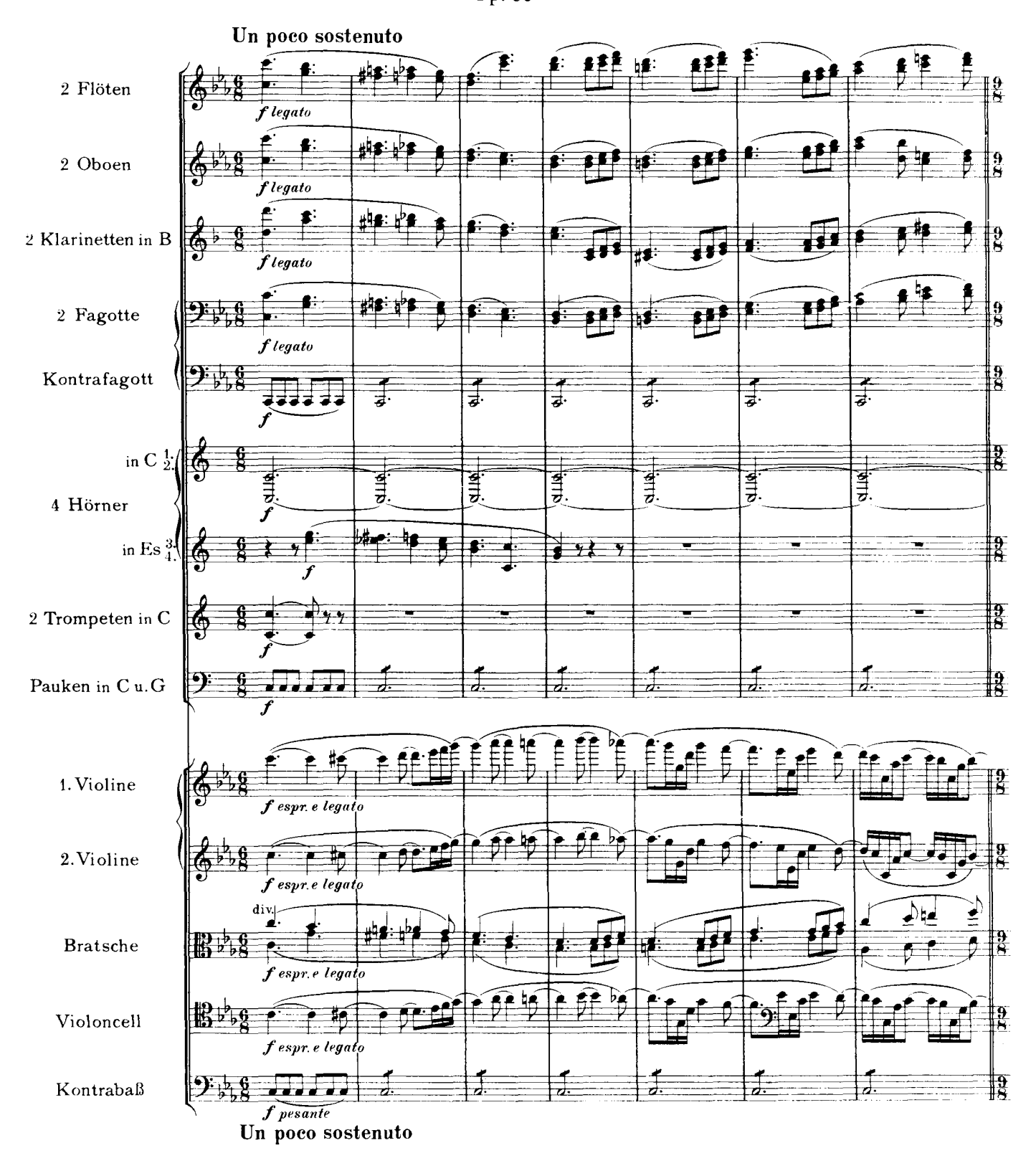
Brahms Symphony No. 1 in C Minor Op. 68